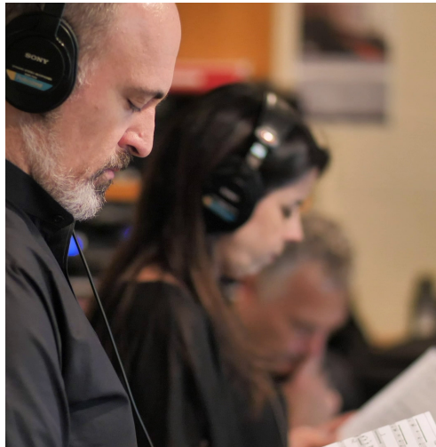
Behind the scenes with Pacifica Quartet at Souvenirs of Spain & Italy recording session

The artists are involved in every aspect of the recording. Sessions can take place over a few days in a single venue or may span weeks or months in a wide variety of venues depending on the needs of the musicians and repertoire. Artists listen to takes with the producer and engineer for balance, clarity, and interpretation before the project moves to post-production. The engineer splices takes together based on the