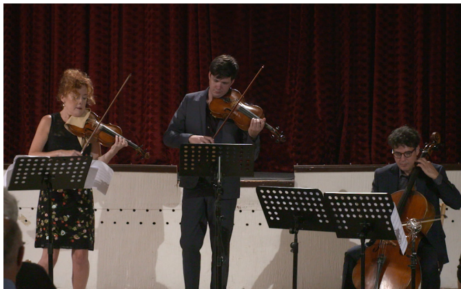
Black Oak Ensemble performing at the Terezin House of Culture, July 2019