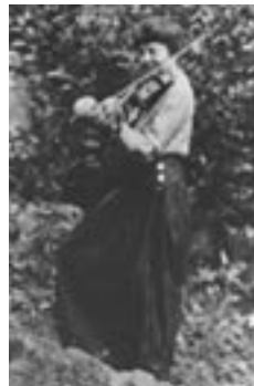
Playing “Molly on the Shore” by Percy Grainger to the Irish well-digger at her summer home, 1919