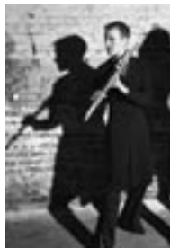
Michael J. Maccaferri clarinets